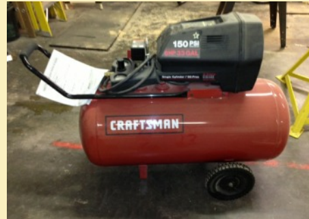
Compressor 6 hp 150 psi 33 gal Oil free