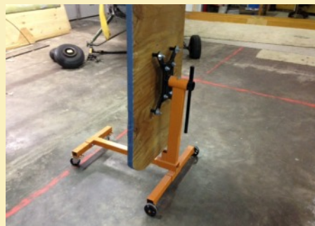
Engine Stand Bolt your engine mount to plywood and rotate as you please