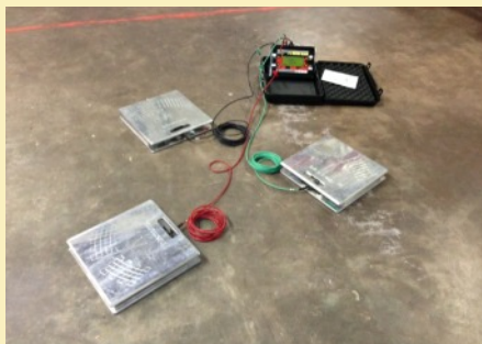
Electronic Scales comes with ramps $20 rental fee